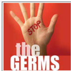
Point of care hand hygiene for Healthcare