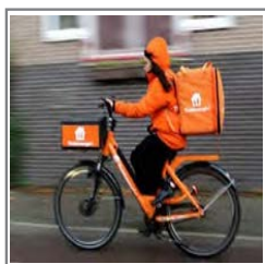
Meal: before they eat their meals